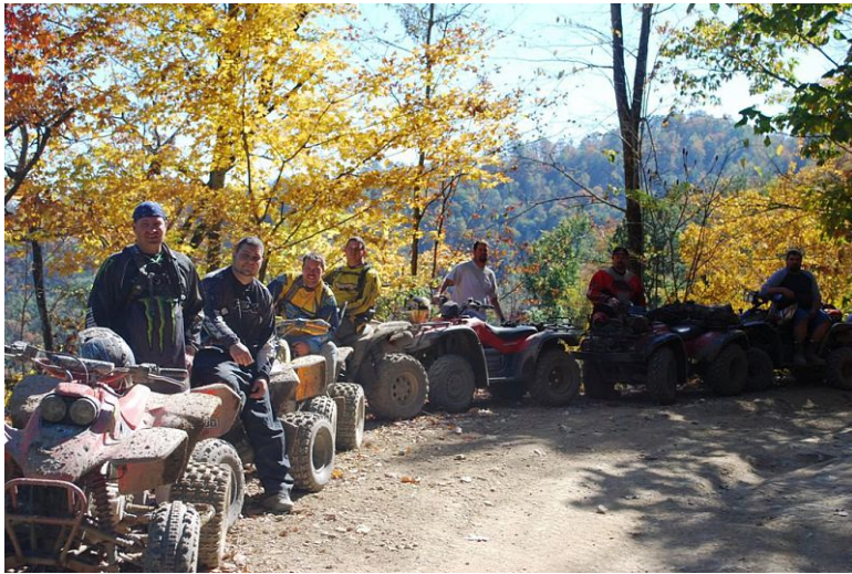
Connecting to Hatfield and McCoy Trails