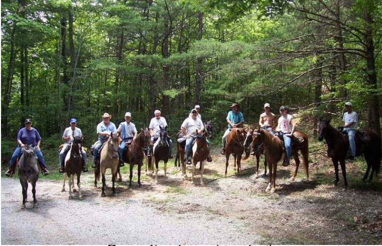
Promoting Equestrian Trails